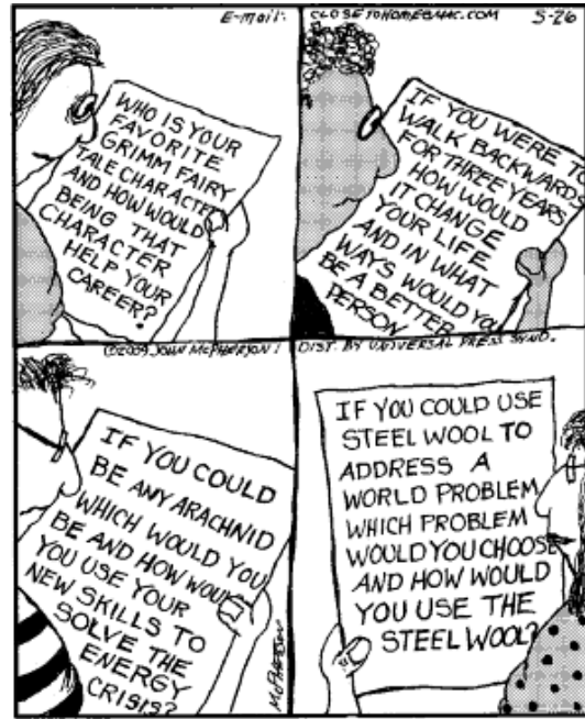
The bane of every college applicant: the admissions essay.